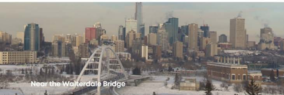
Near the Walterdale Bridge