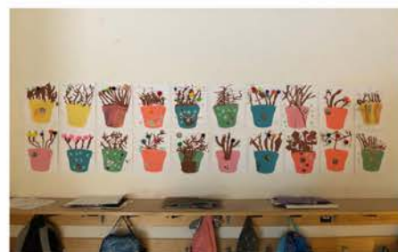
Rm. 1 "Tu B'Shevat Artwork"