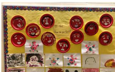
Rm. 5 "How Do You Feel?"