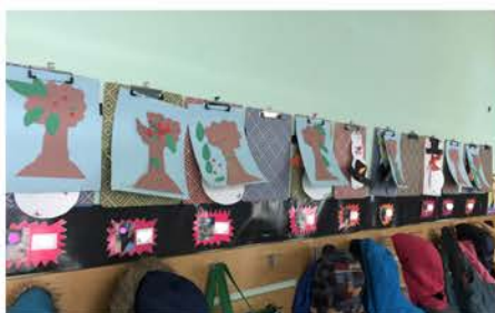
Rm. 2 Tu B'Shevat Trees