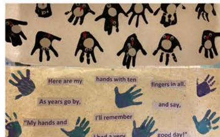
Rm. 4 "These Are My Hands"