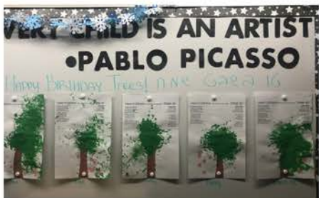
Rm. 3 Tu B'Shevat Art