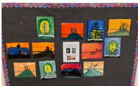
Rm. 6 "The Group of Seven Art"

One of the things the educators will be focusing on for the next several months is creating curriculum as it relates both to the Holistic Play Based Goals (presented in Alberta's Flight Curriculum Framework) and Talmud Torah's official Values. This term we are focusing on the "Diversity and Social Responsibility" goal and the Value of "Community/קהילה" as articulated in Talmud Torah's Mission, Vision, and Values statement.