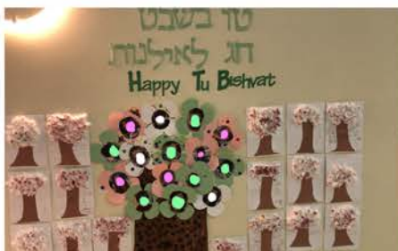
Rm. 1 "Tu B'Shevat Trees"