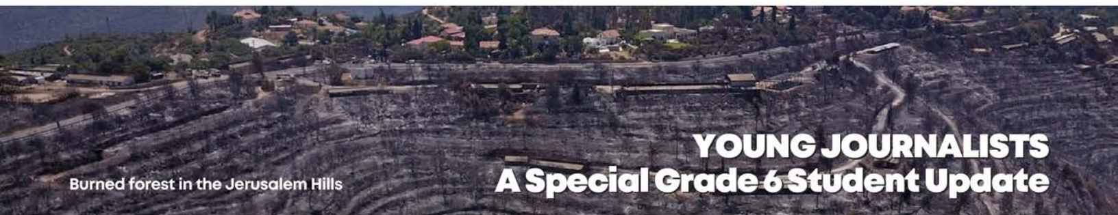
Burned forest in the Jerusalem Hills