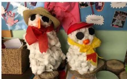
Rm2. "All Dressed Up For Winter"